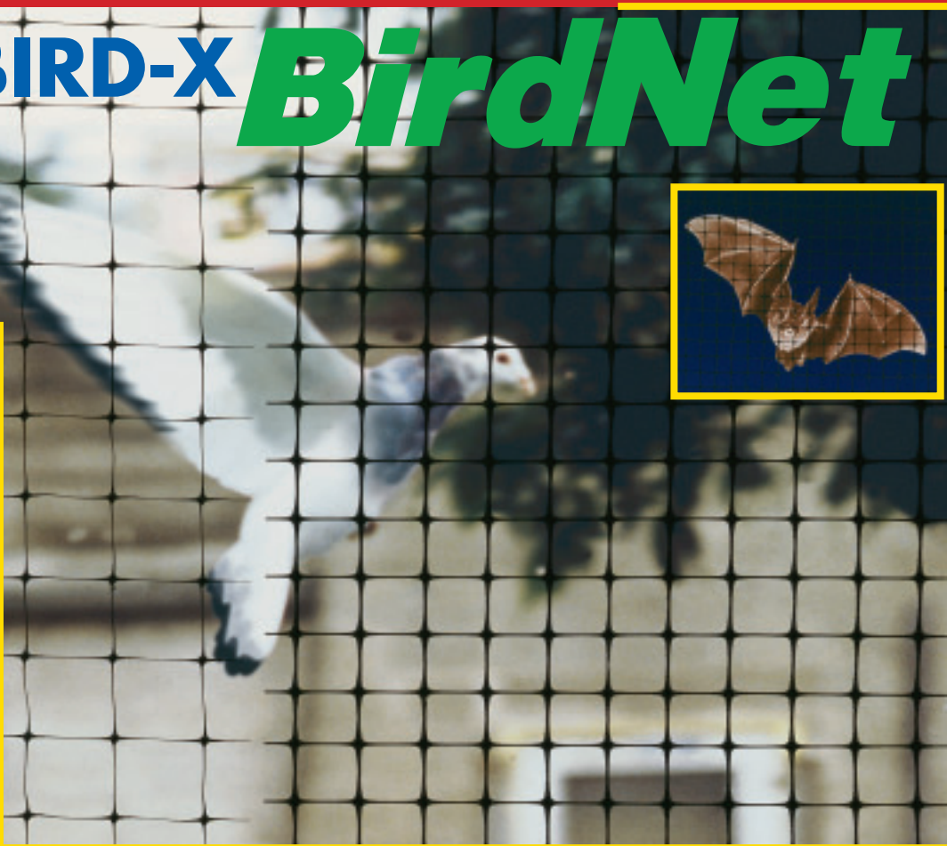
"Standard" (not actual size)